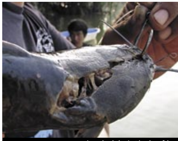
I cursed my luck as I retrieved a catfish livebait which had been crushed and spat out by a stingray; I was devastated.