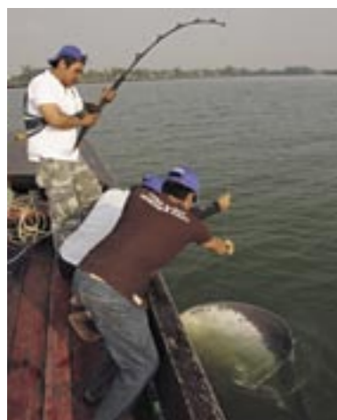
The fish surfaced relatively quickly in shallow water but Q couldn't hold it and it dived again.