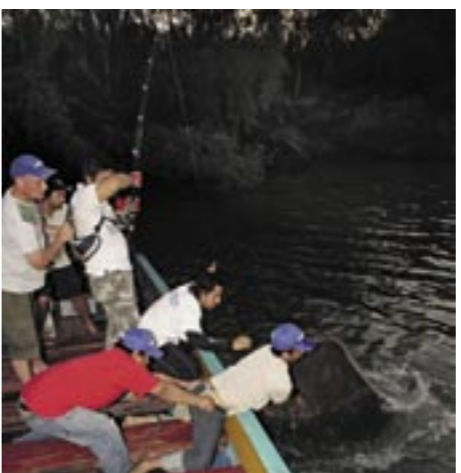
The boys lunge to secure the fish in the twilight and make no mistake at the second time of asking.