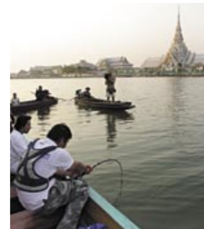
The cameras kept rolling as the light started to fade and the mammoth battle went into its third hour.