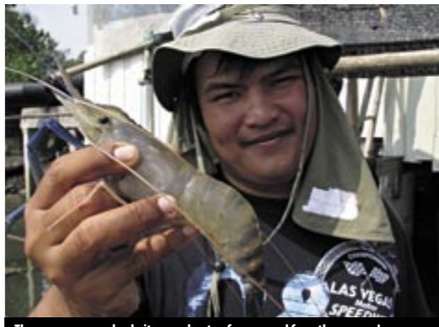
The prawns we used as bait were about as far removed from the prawns I use as bait back home as possible. With massive shoals of these lobster-like beasts in the rivers it's little wonder the fish thrive.