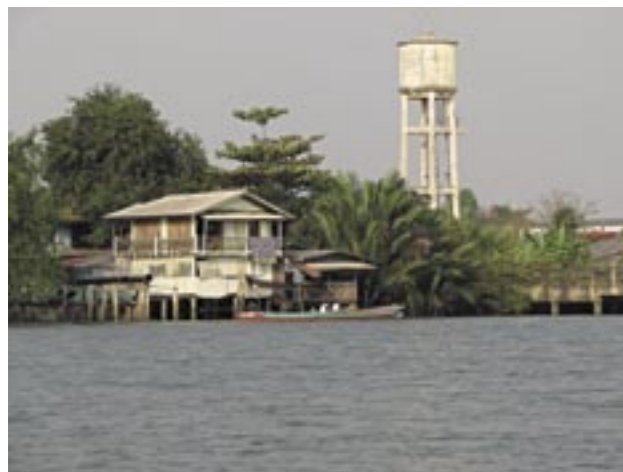
Base camp on the Bang Pakong, and unlike 2008 the river was carrying very little pak and was in excellent shape.