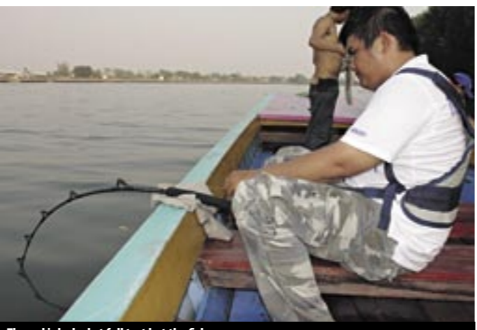
The rod is locked at full test but the fish is still not moving; the cloth prevents the rod from cracking on the gunwale.